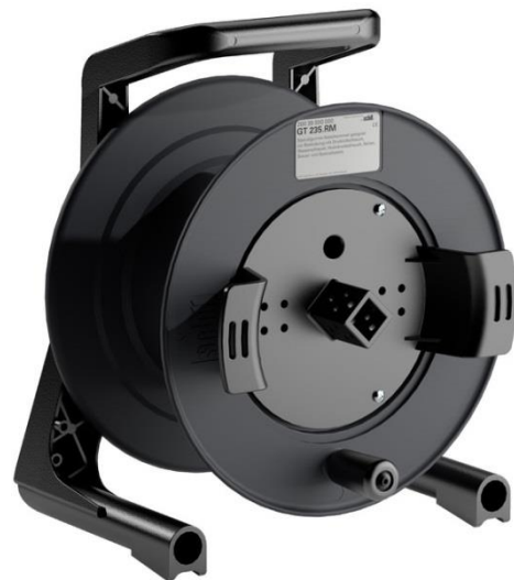
GT235 with RM Flange